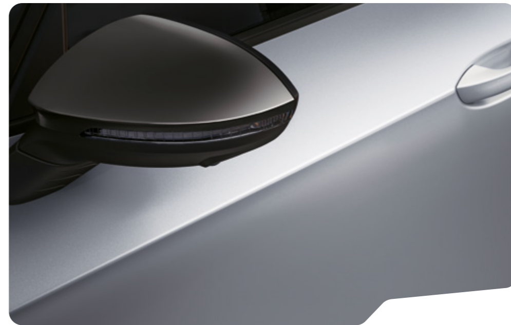
↓ GLACIAL WHITE 2