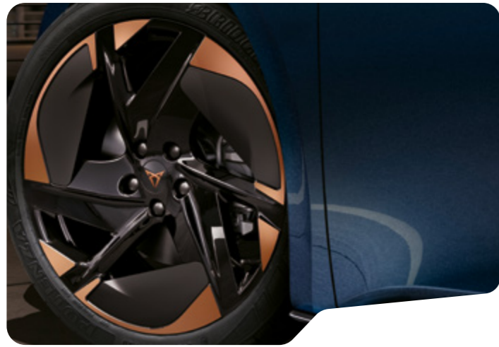
→ 20" BLIZZARD □