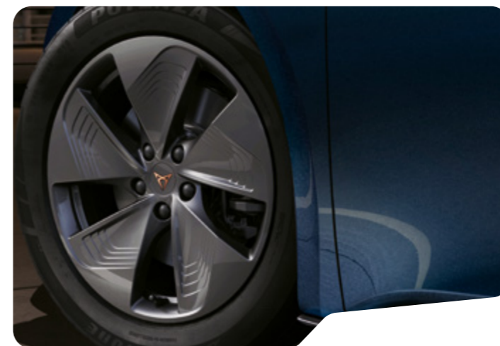
↑ 18" CYCLONE □

Our global range of cars and product specifications varies from country to country. Please, visit your local CUPRA website to know more about the product offer available for you.