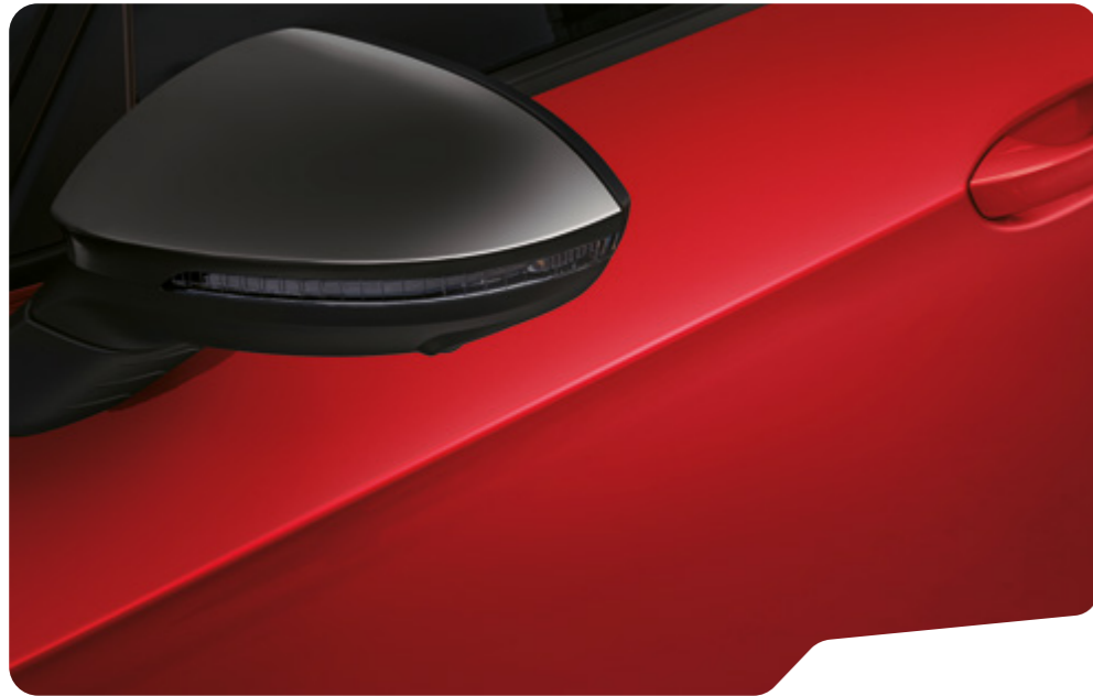
↓ RAYLEIGH RED 2